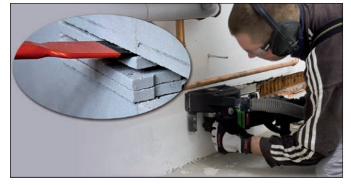
Standard Equipment: 2 premium diamond blades, carrying case and spanner wrench.