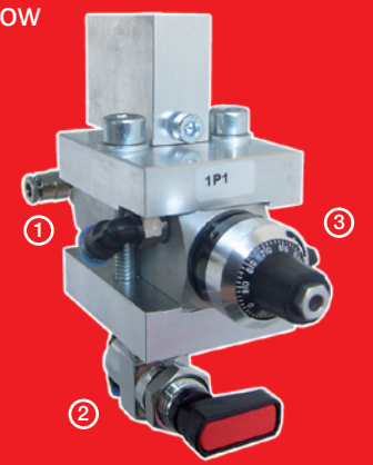
Fig.: Pump module L60