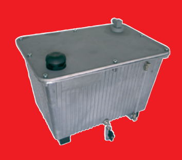
Fig.: Reservoir A27AWNC